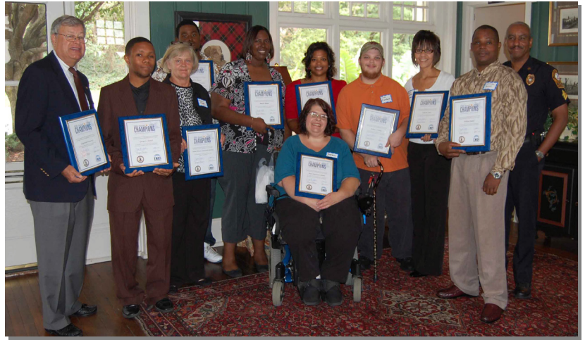
Blue Ridge Region celebrates Disability Employment Month

The event was held at the historic Farmville Train Station. Two DRS consumers provided powerful testimonials of their DRS experience and their road to successful careers. Among the awardees pictured above are representatives from Longwood University, Longwood University Campus Police, and Crossroad Services. Other recipients not pictured include CVS Pharmacy and English Construction Company.