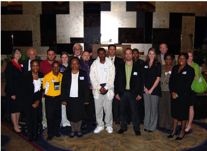
2010 Disability Employment Champions Award Winners

The 2010 Disability Employment Champions Award recipients included the following recipients below. Included this year were four business partners involved in the Project SEARCH program, a one-year training program for high school seniors with significant disabilities to gain hands-on work experience in a professional workplace setting and receive useful feedback on their performance.